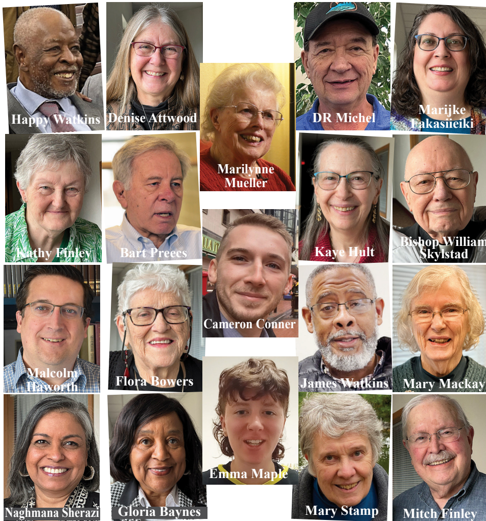
Nineteen supporters and staff of The Fig Tree share comments in the Benefit video.