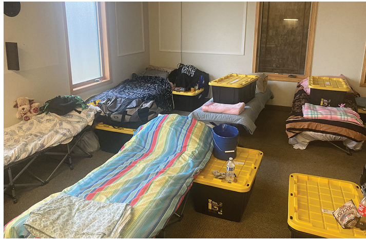
Cedar warming shelter offers beds and boxes for belongings.

Volunteers connected him to CHAS and Pioneer Human Services, which helped him contact his insurance agency. They also