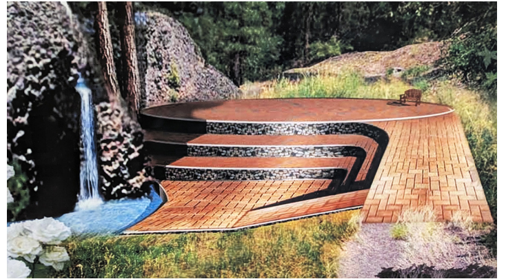
Suncrest church creates grotto as a sacred space.