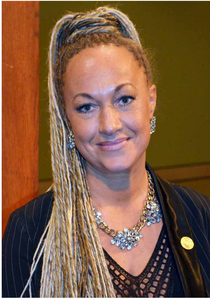
Rachel Dolezal urges moving toward liberty and justice.

"We continually see legislation and practices that seek to undo the 13th, 14th and 15th amendments, and people who want to rewind back to the original U.S. Constitution in which we were deemed three-fifths the value of other human lives," Rachel said. "Even with a Black President in the Oval Office, national, state