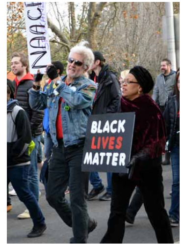
NAACP-Spokane recreates banner from a 1960s march, top, and carries a "Black Lives Matter" sign, right. Grant Elementary School leaders share an essay on their dream, above.

they want to see and to focus on what they can achieve.