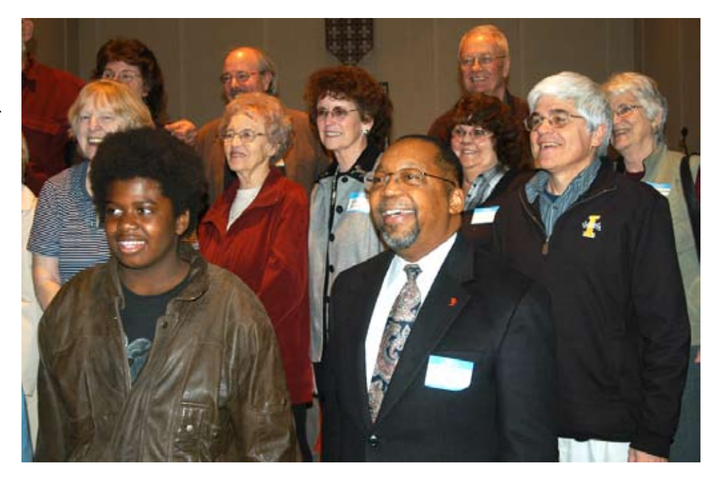
First Congregational United Church of Christ in Colville with 20 drew one of largest delegations to visit with the Rev. Geoffrey Black in Spokane, center front.

New York state, where he was con-Continued on Page 8