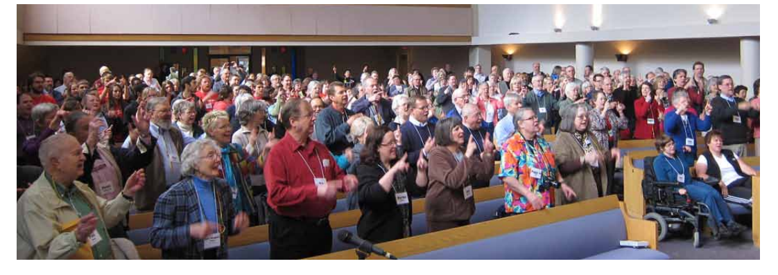
Annual Meetings, such as 2011 at University Congregational UCC in Seattle, stir unity, relationships.