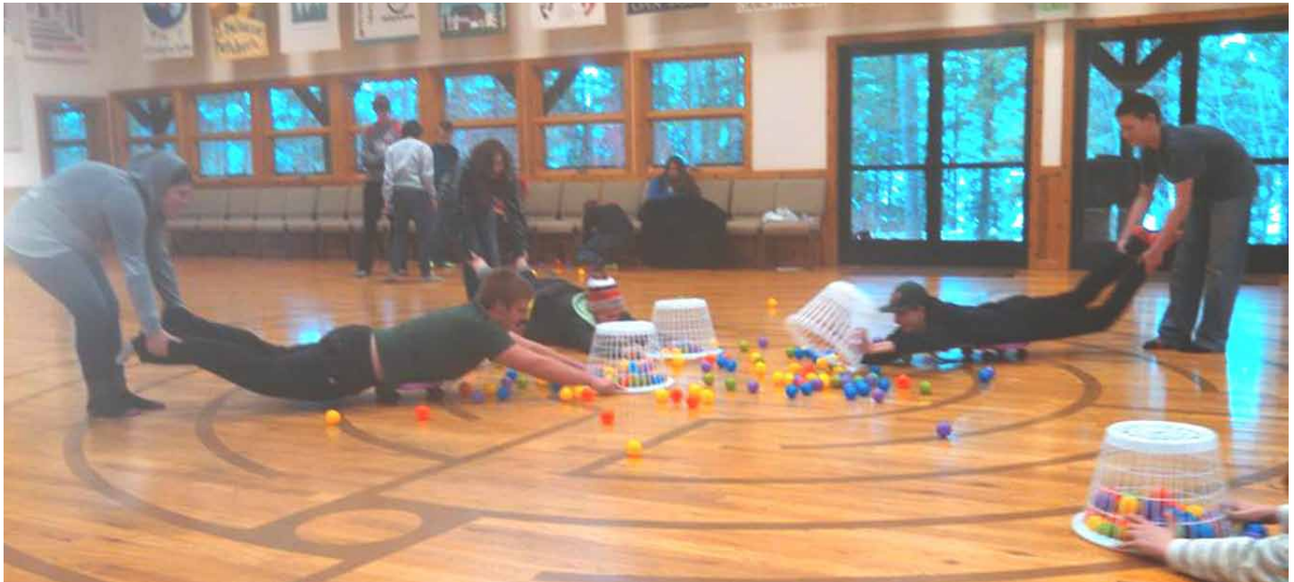
Mid-Winter Retreat participants at N-Sid-Sen joined in a hungry-hippo game on the floor of Stillwater Lodge.