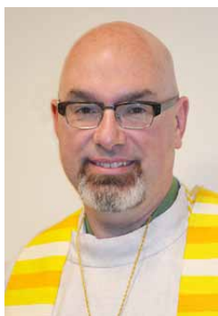
By The Rev. Mike Denton Conference Minister

What does it mean to wear a clergy collar?