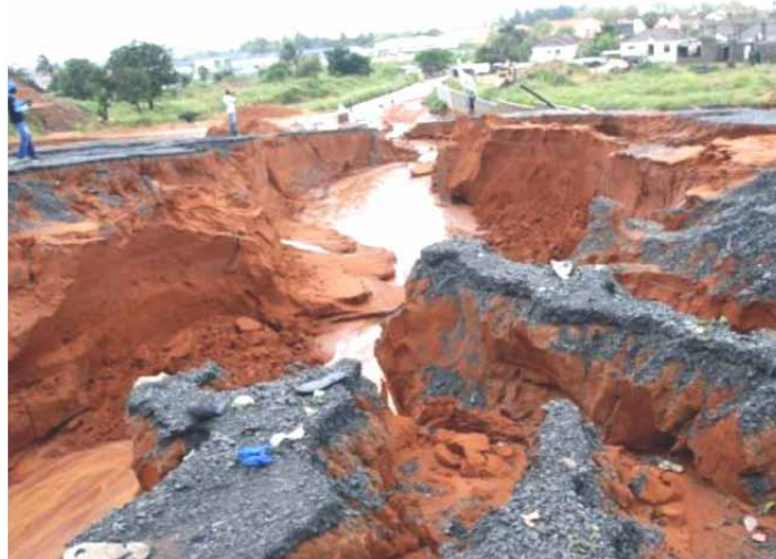
Road flooded out in Mozambique.

Noting that the Zulu ethic says, "I cannot be fully me un-