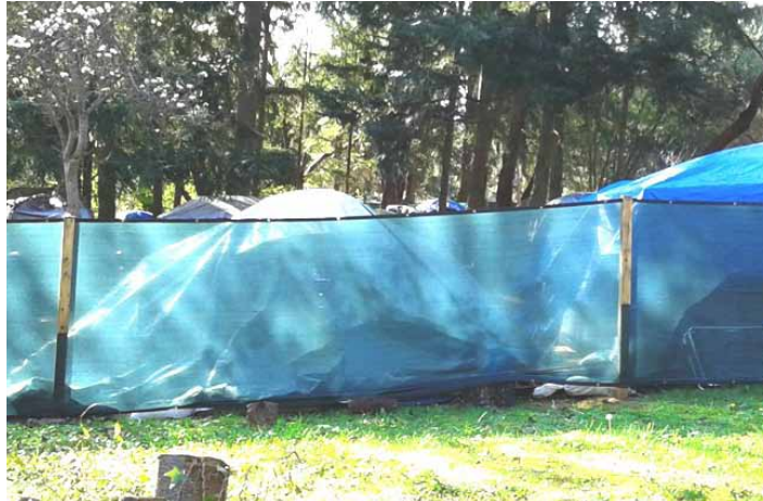
Homeless set up tents for 90 days.

"Prior to hosting the encampment, our outreach has included providing transitional housing by working with Compass Housing Alliance to use the two houses that we own, providing meals and needed items to Mary's Place and