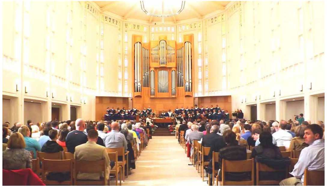
Above: Worshipers gather for one of the first services in Plymouth Seattle's renovated sanctuary. Below, a contractor lays tile for the new flooring, part of the acoustical enhancements.