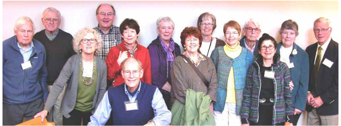
14 University Congregational UCC resolution signers.

Several workshops will cover the subject at Annual