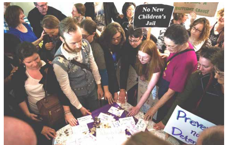
Protestors put coins and message cards.