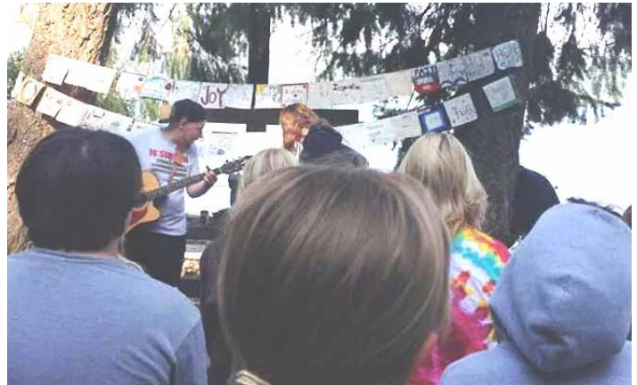
N-Sid-Sen campers use prayer flags in worship before sending them.

tentions, but some have the idea that they are white saviors,” Irene said. “What many of them do creates more problems and political divisions.