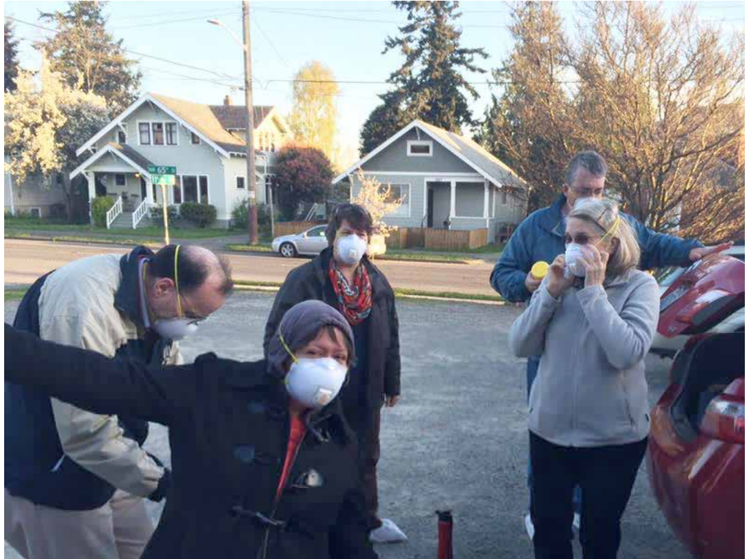
Members of St. Paul UCC put on face masks for protection from asbestos released by the fire.