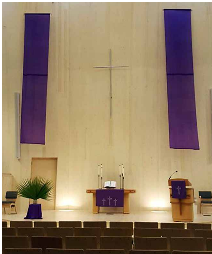
New sanctuary and chancel have open, light ambience.