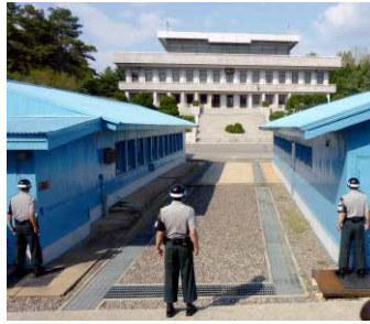
The DMZ - Demilitarized Zone - on the South Korea-North Korea border is one of the sites the delegation will visit.

The PROK was created in 1953, after breaking away from the larger Presbyterian Church