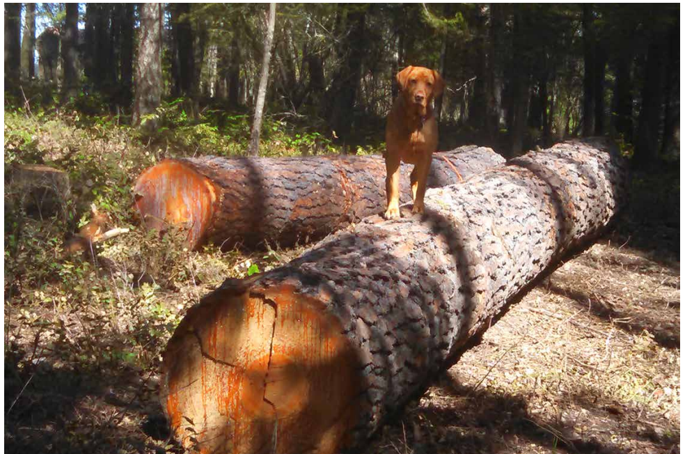
The camp dog, Sage, stands on top of two trees cut down because of root mold and beetles.