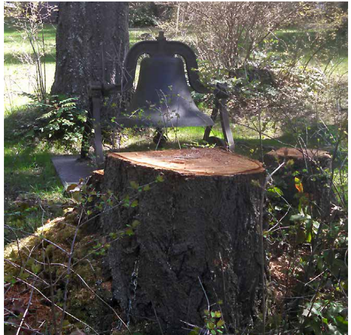
Open view from a cabin to the lake and a stump by the bell.