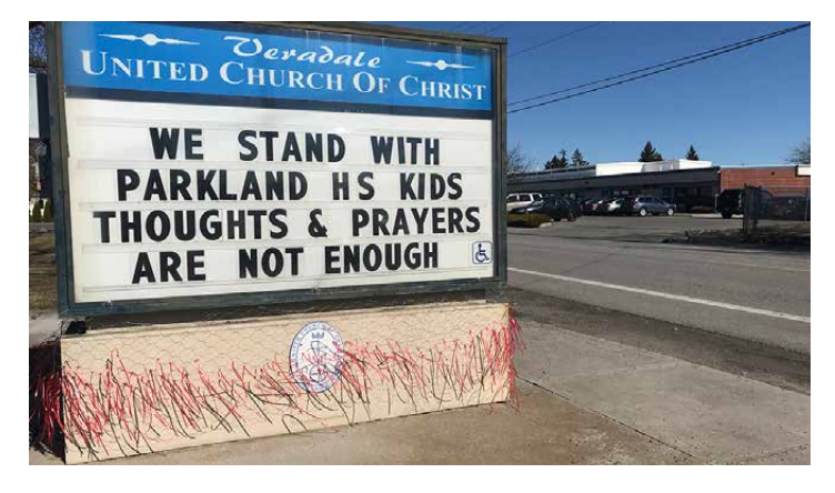
Veradale UCC signboard in Spokane Valley is interactive.

German UCC in Seattle opens doors to people during marches.