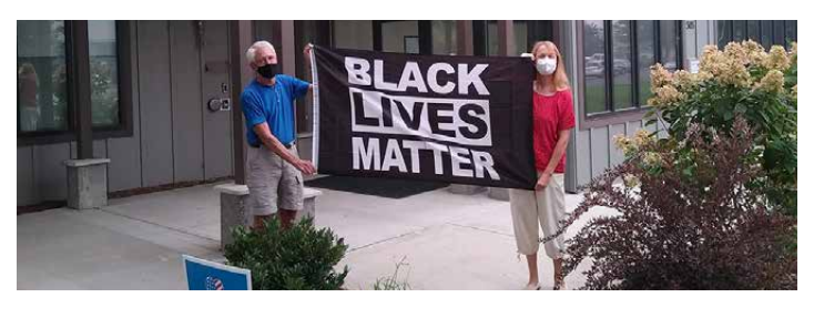
Shalom UCC in Richland top, and United Churches of Olympia join in calls for racial justice and dismantling racism, below.

She was awakened to the concern taking an Undoing Institutional Racism class during a year in the Jubilee Justice program. In addition, Plymouth UCC in Seattle, where she has been a member since 2018, is also discerning how to be an