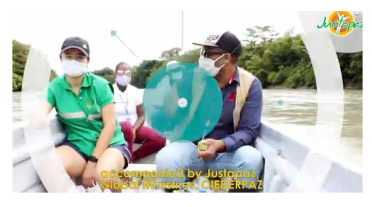
Photo from the Justapaz video shared as part of the September 2020 Peace Pilgrimage.