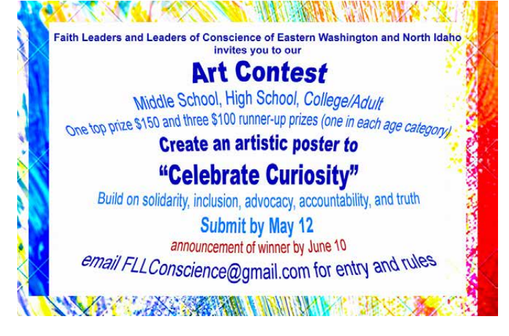
Inland NW faith leaders respond to hate with an art contest.

FLLC was looking for something to do in addition to