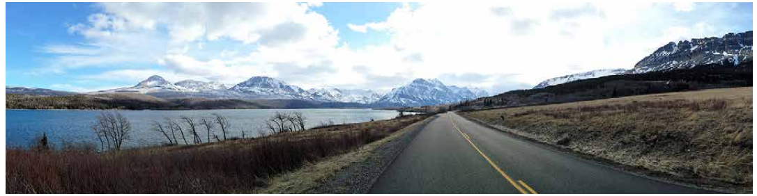
Long road trips introduce Dee Eisenhauer to sights of region.

She asked each minister the same 12 questions to learn about their ministry careers; when they realized they were