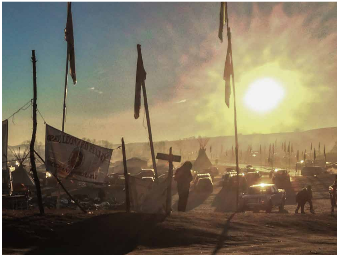
Flags, banners, cars, teepees, and people are silhouetted by the rising sun.

Indigenous nations that were enemies are now allies. This will not be turned back. Tribal people are finding their