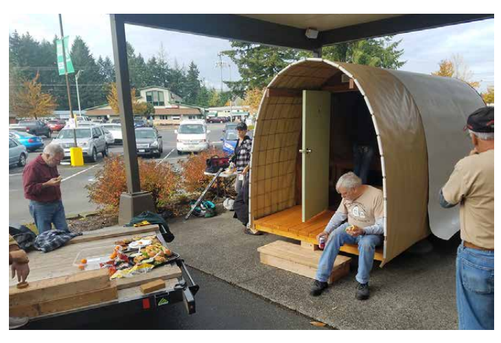
At the fall workshop, participants built a Conestoga house.