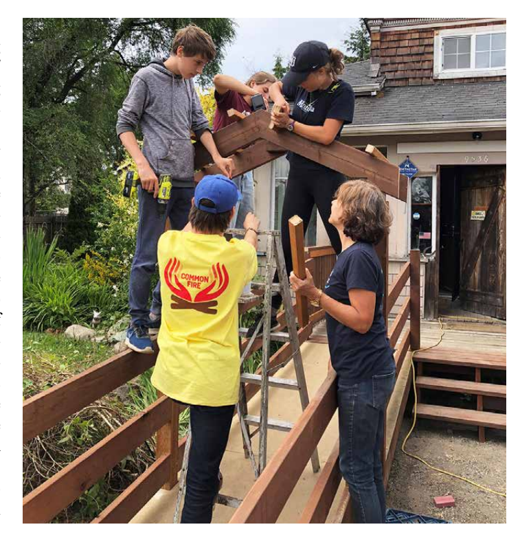
One team builds bridge to make home more accessible.

On June 26, Alicia wrote that "tearing down and rebuilding ramps, emptying out and filling in pools, ripping out rotted boards and refinishing a