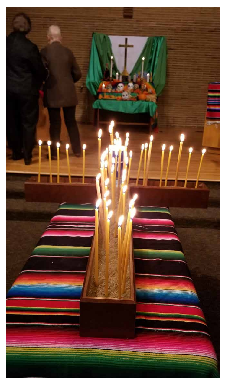
A Mexican cross with lighted candles is set on a Mexican rug on a table in the aisle.

She asked members of the churches to send her names of loved ones and she put them to the tune of "For the Healing of the Nations," which has been used to honor different coun-