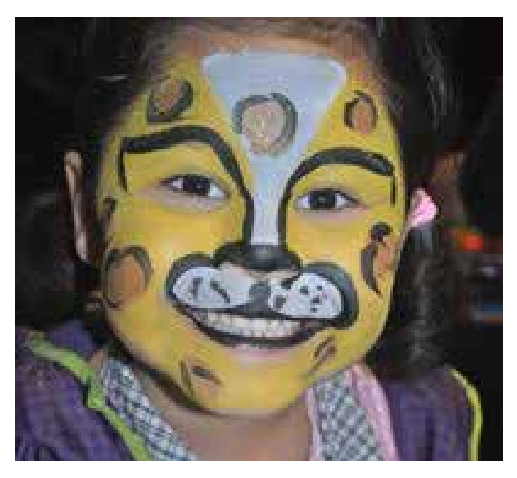
Girl with face painting at the Harvest Festival for Spanishspeaking voters with translation into Spanish.

For information, call 509-371-8000 or email shalom@shalomunitedchurch.org.