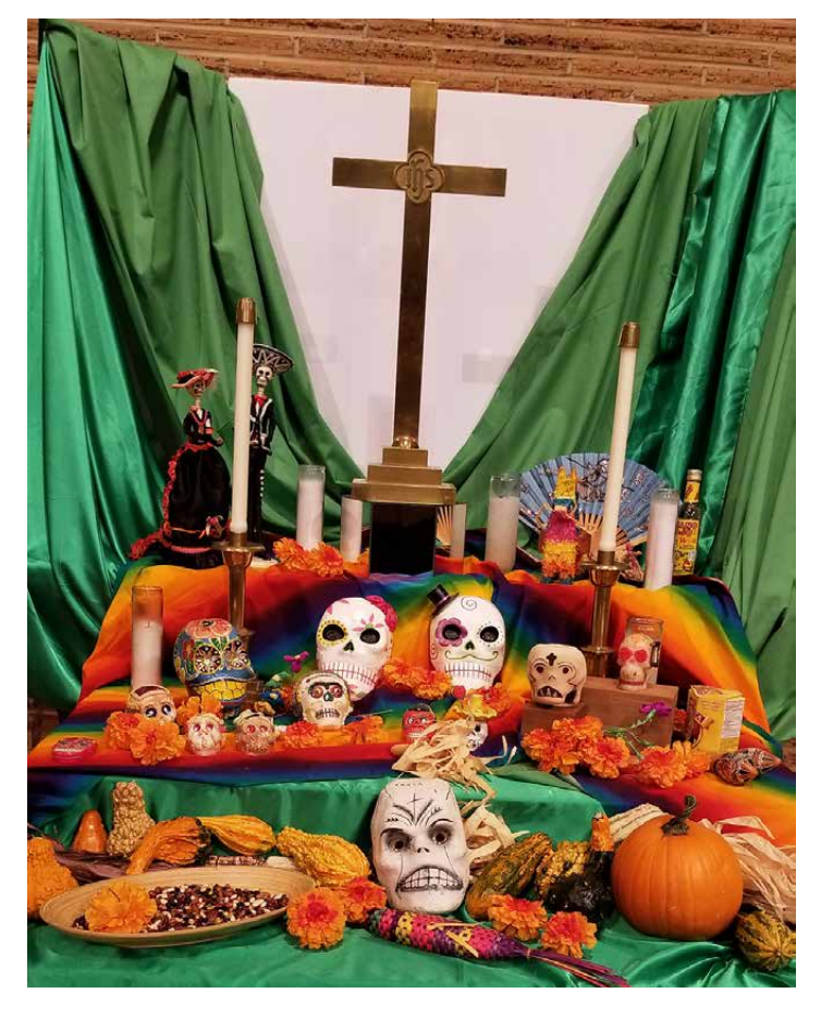
Day of the Dead altar setting.

"All Saints and All Souls Day evolved into celebrations that today honor the dead with