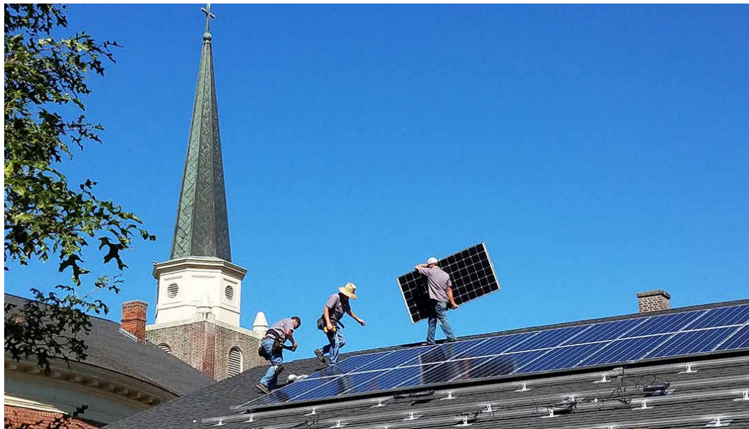
Crew mounts solar panels on the roof of First Congregational UCC in Walla Walla.

"Every Sunday as part of our statement of identity, we say, 'It is our mission to enable personal spiritual growth, col-