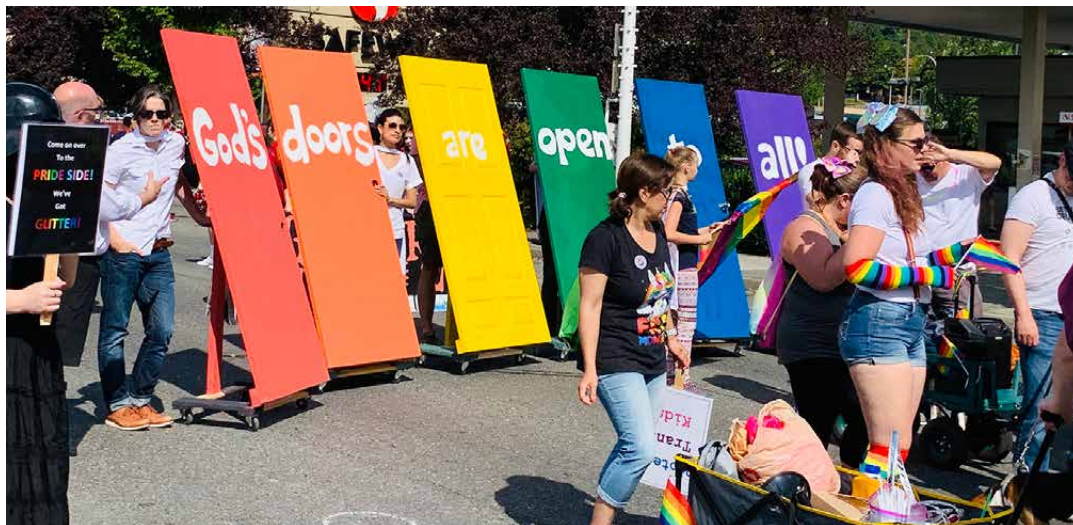
Renton United Christian Church members walk with doors in River Days Parade July 27.

Members of the UCCs ecumenical partner, the Christian Church (Disciples of Christ), took social-justice actions at their July General Assembly similar to those taken a month earlier by the UCC General Synod on global migration,