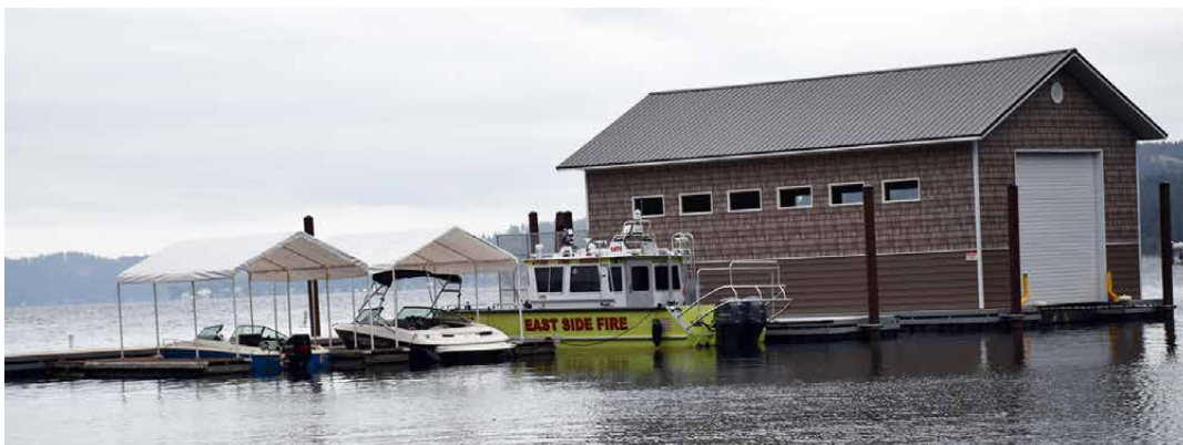
N-Sid-Sen fireboat and fireboat house is now an established part of the scene in the cove.

For information, call 208-689-3489 or visit www.n-sid-sen.org .