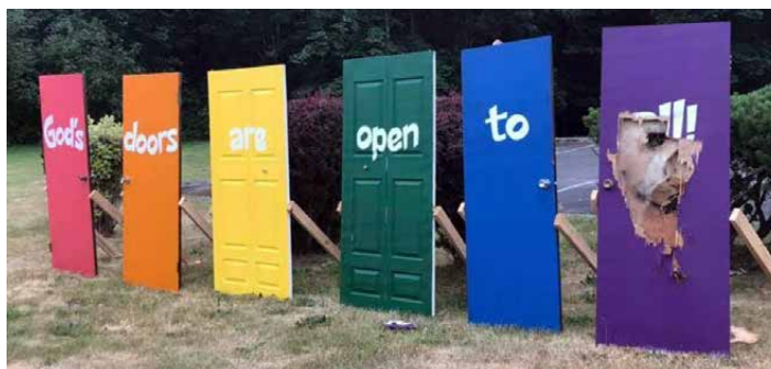
Door with “all” damaged. Other doors damaged later.