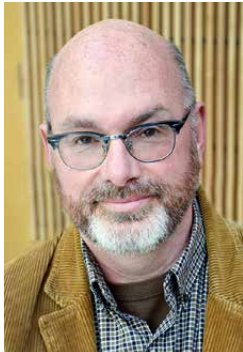
By The Rev. Mike Denton Conference Minister

It's obvious we're doing more than we were created for.