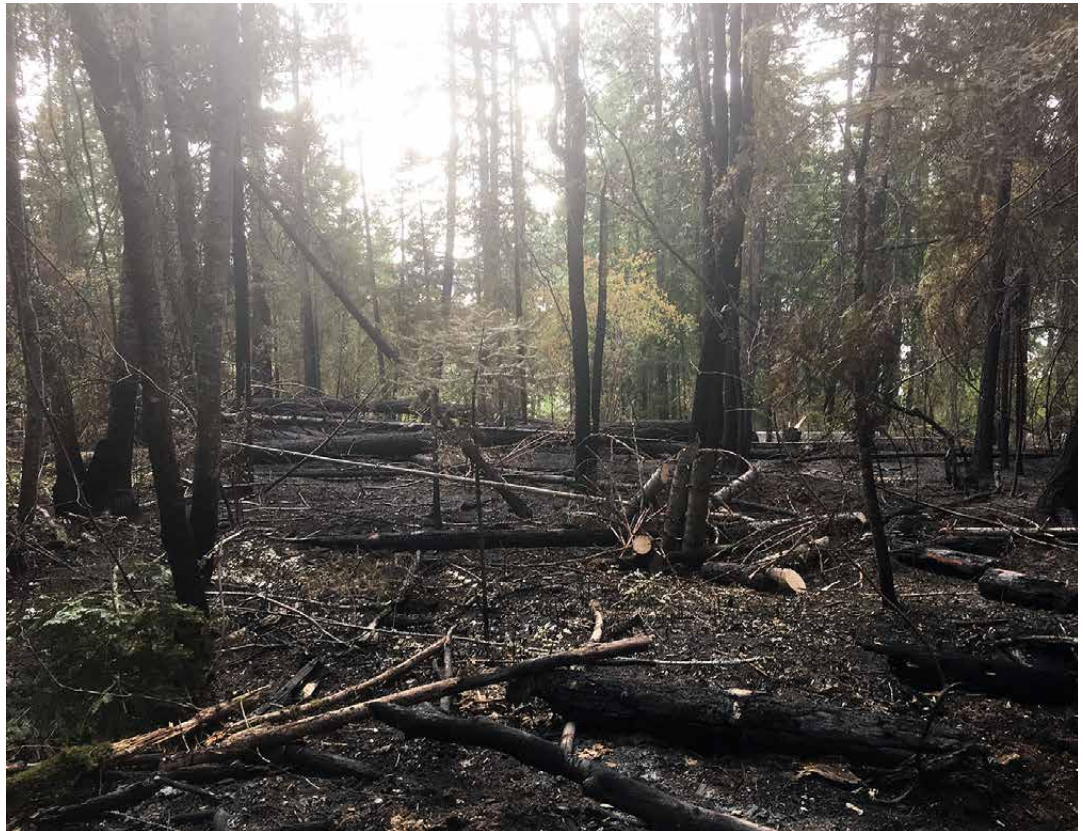
About an acre of N-Sid-Sen's forest burned Aug. 16, but it was out in a few hours.