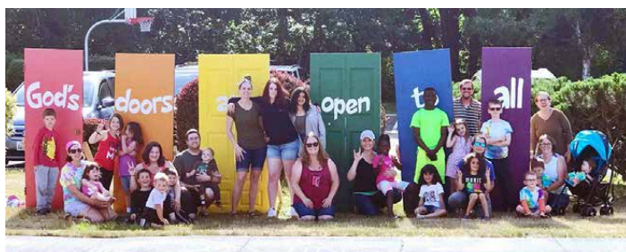
Church and neighbors repair and reinstall doors.

dance of 40 to 50 on a Sunday, repaired/replaced the doors and later displayed them in the Renton River Days Parade.