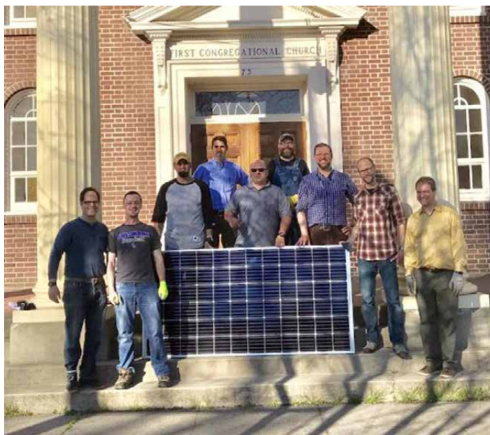
Group unloaded the panels from a truck that shipped them from a warehouse in Boise, Idaho.