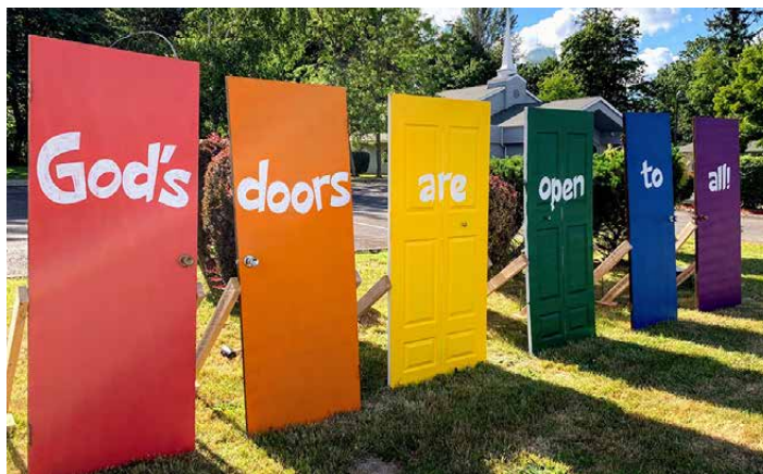
Church set up display of “God’s Doors” in their yard.

The vandalism led to an outpouring of prayer and support, so the church, with atten-