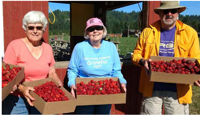
Homemade strawberry jam is a draw for the pancake breakfast.

Another commented that her granddaughter, a Seattle