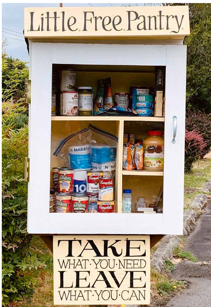
Free Little Pantry is yet another community outreach.

private prisons, interreligious relations, plastic use, energy innovation, denouncing hate,