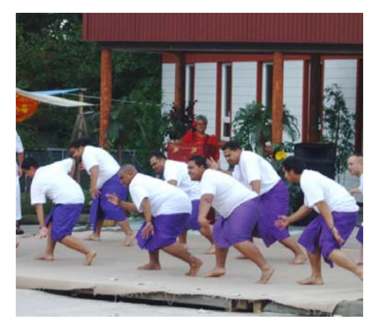
Samoan men perform a dance for cultural celebration.

churches relate with the UCC, which at General Synod in 1999 adopted partnership in mission and ministry with the CCCAS.