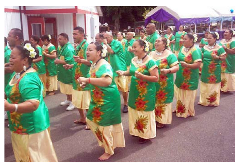
Dance and song help keep interest in the Samoan culture alive for younger generations.

Some of the funds will also help with Continued on Page 4