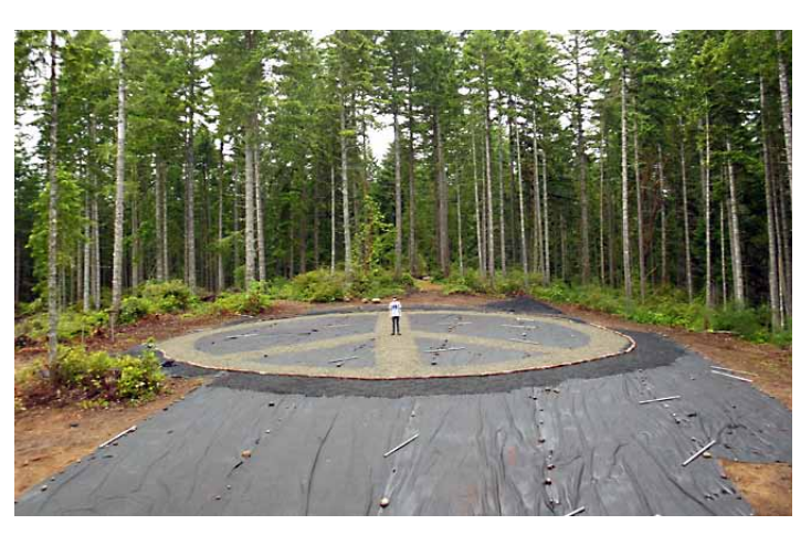
Kendall Crane from Admiral UCC stands in the peace sign at the top of the Peace GArden at Pilgri Firs.

Most of the "construction phase" for the garden will be done by campers, beginning with junior and senior high camps last summer and running