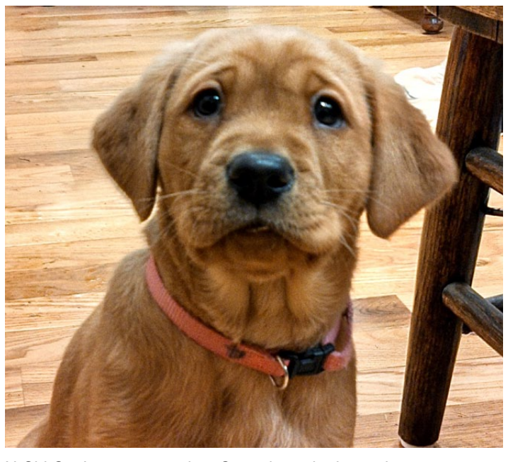
N-Sid-Sen's new camp dog, Sage, is excited to welcome campers to camp.

For information, call 208-689-3489 or visit n-sid-sen.org.