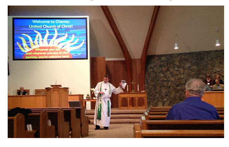
Cheney UCC's projection system was ready for use by Christmas.