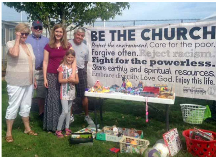
Fox Island members greet people visiting at detention center

They began this ministry in May 2016, coming one Sunday afternoon a month during visiting hours from 1 to 4 p.m. to provide beverages, snacks, sandwiches, toys and books to serve and feed people in this