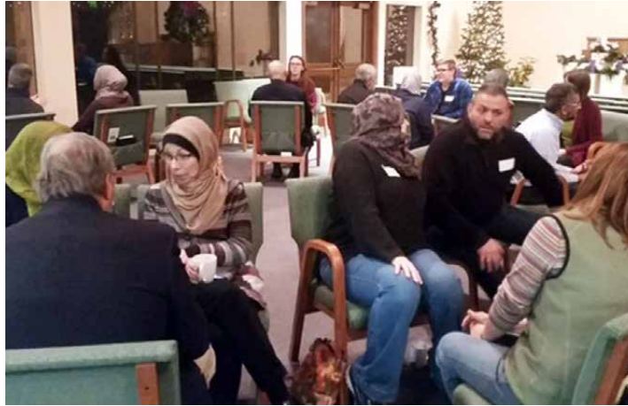
Northshore UCC in Woodinville helps congregation and community address prejudices.

it a "good ice breaker" and were interested in meeting again.