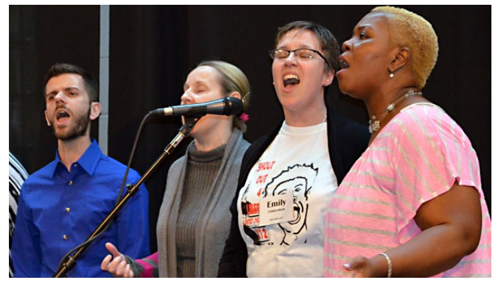
Members of Liberation UCC offer a concert for banquet.

• Another resolution that passed calls for educating congregations on the living wage and income inequality, listening to workers and employers and walking with them to a living wage future. It also encourages local churches to consider endorsing the Church Council of Greater Seattle's Living Wage Principles.