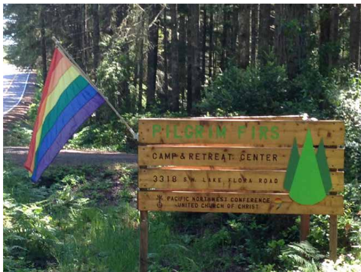
Rainbow flag on the sign at Pilgrim Firs for the LGBTQ retreat.