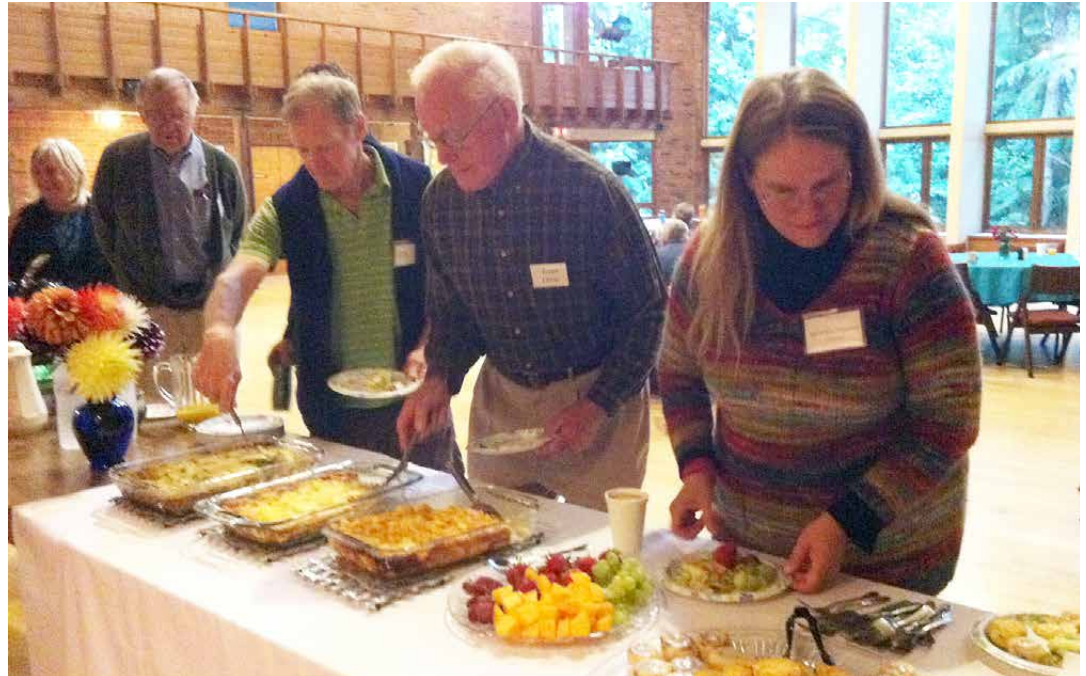
Congregational Church of Mercer Island hosted PNC Board members at their recent meeting.

We need to open ourselves to being immersed in it, to wonder what stands in the way that hinders its blooming. We invite members of the PNC to risk with us as we engage this year in new ways of being together as Conference at our Annual