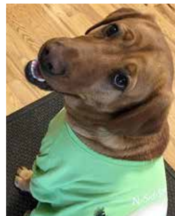
Sage tries on N-Sid-Sen T-shirt.

For information, email wade@pilgrim-firs.org .