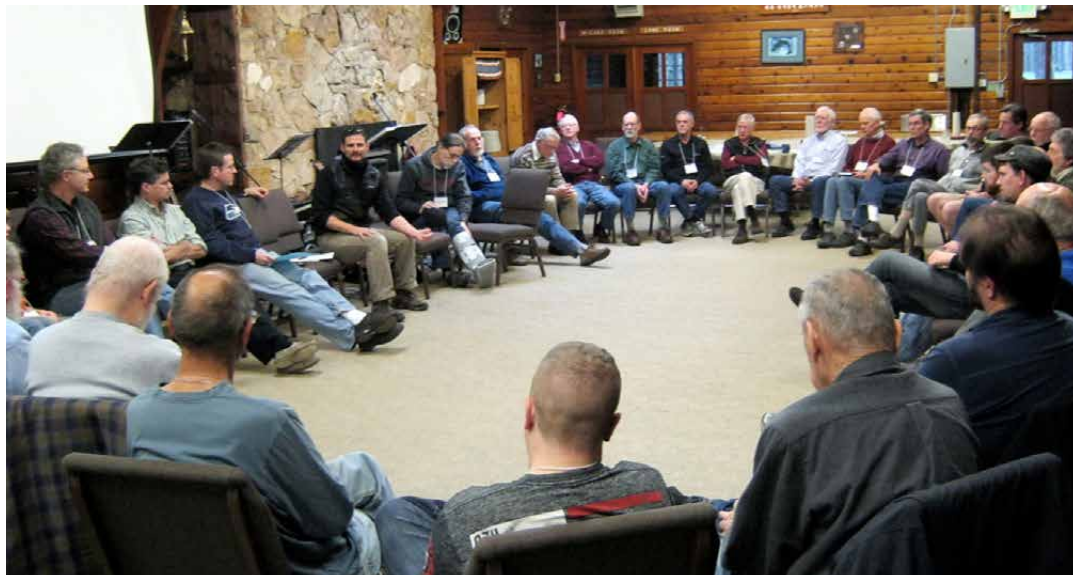
Men gather for presentation during the PNC Men's Retreat in January, 2015, at Pilgrim Firs.

"When I first came to Men's Retreats, I came to listen and experience the retreat,"