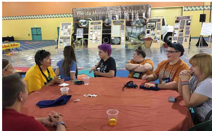
Youth engage in discussion at the National Youth Event.

PNC youth spent a few days beforehand doing some service, learning about and getting to know the others travel-