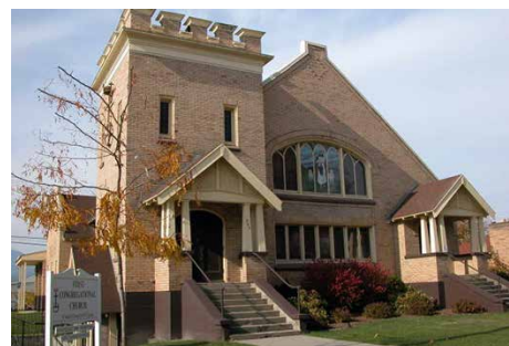
Photos of the Colville First Congregational UCC building in 1895 and today.