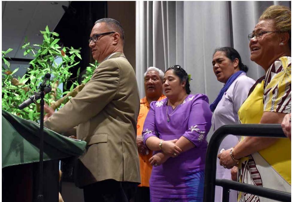
Faavae Fou members meet other PNC members and share in worship at Annual Meeting.