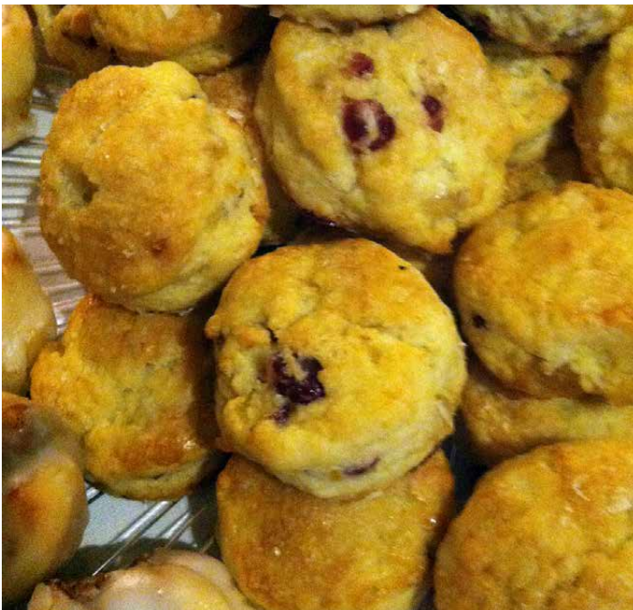
Biscuits, fruit, pie flowers spoke of church's warm welcome.

For information, call 206-484-9814 or email pilgenfritz@universityucc.org