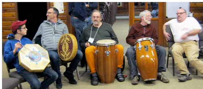
Musicians team during the 2016 Men's Retreat.

For information, call 206-999-6968 or email myrtos@comcast.net .