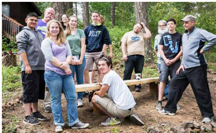
Senior High Aqua Campers build a new bench on a trail at N-Sid-Sen. They used wood from trees cut in the spring.

Between workshop sessions will be time for rest, conversations, hikes in the woods or canoeing on Lake Flora.