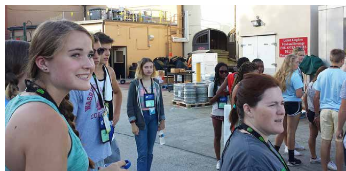
Youth join in a mission project at Fauntleroy UCC before the NYE.