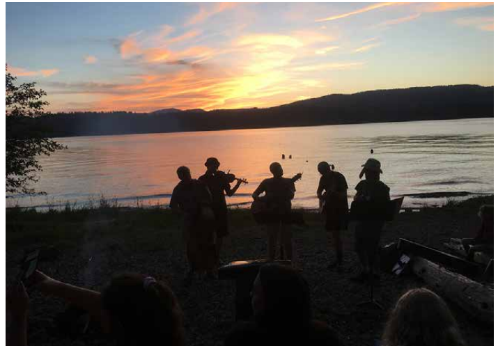
Sunset musicians accompany singing.