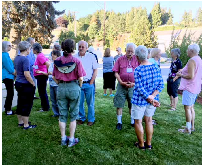
Summer Stewardship Conference participants share.

The materials provided a theological foundation for generosity and also gave participants a chance to reflect on