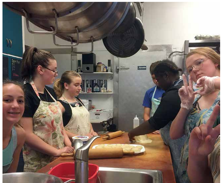
Culinary group formed at N-Sid-Sen this summer.