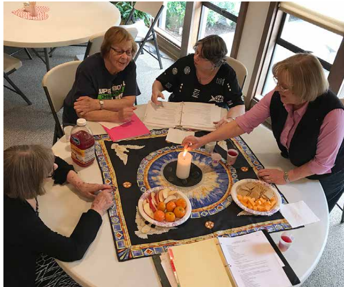
Small covenant group meets at Ferndale UCC.

The newest curriculum provides preparation materials along with step-by-step guidelines for up to 22 sessions focusing on The Spiritual Journey and organized around themes: The Art of Noticing Your Life,